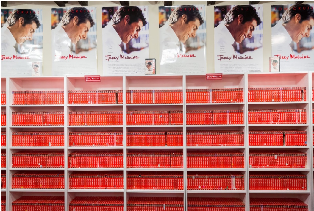
Figure 1: Jerry Maguire video store

in the desert landscape of Joshua Tree National Park in 2020, though Covid-19's disarray of everyday life has presumably stalled these plans. On their website, they explain that they have been "working with a team of architects, engineers, and builders to design this epic monument to America's consumption." 2 This not-(yet) realized monument begs the question: Why Jerry ? And to answer that, a bigger question: Why has this particular popular film had a formidable number of afterlives in the twenty-first century?