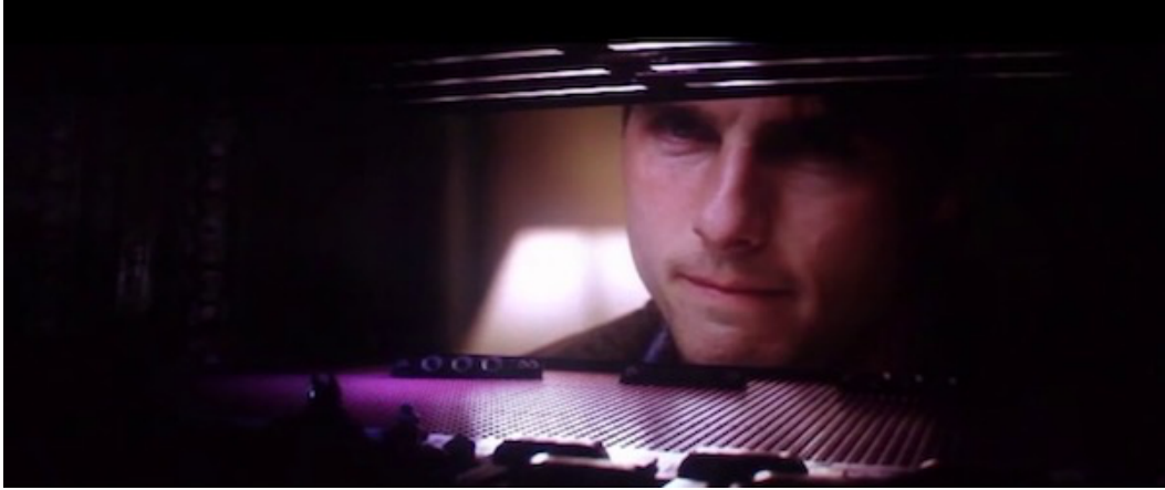
Figure 4: Live-action Jerry in Batman's animated home theater