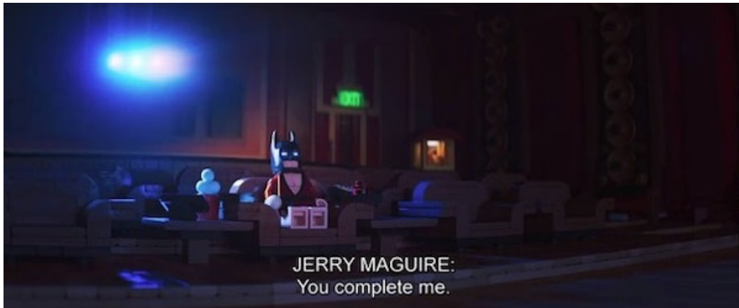
Figure 3: Batman watching Jerry Maguire in The Lego Batman Movie (2017)

within a wider range and longer history of animation practices. 19 Early in Lego Batman , the Will Arnett-voiced Batman sits alone in a personal movie theatre in his bat cave, fidgets with two controls in his hands, and adjusts the source channel on the big screen. Scrolling down the list of options, he hovers in hesitation over different fields and finally selects HDMI 2. The screen shows the frustratingly familiar response: “No signal / Device not detected.” Remote in hand, he mumbles to himself as he then scrolls down the same list and chooses HDMI 3. In a rare departure from the film’s frenzied animated world, a photorealistic Tom Cruise as Jerry Maguire sighs onscreen, while a green volume bar rises to maximum level over the reverse shot of Dorothy’s (Renée Zellweger’s) face. The two characters look back and forth at each other in shot reverse shot, and the film cuts to Batman munching on popcorn as we hear Cruise deliver the famous line: “You complete me.” Batman erupts in laughter. We hear Zellweger reply with the perhaps even more famous line, “Shut up. You had me at hello.” Batman chuckles again, more gently, and says “I love it.”