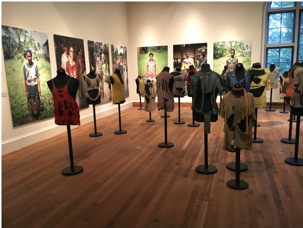
Figure 5. Red Calico (Rood Katoen) #2 , Roy Villevoe, installation view.

This decision to include images of and references to contemporary geopolitics is particularly poignant at the entrance of the New Guinea art display, which includes objects such as shields, textiles, and body adornments. At first glance, this part of the exhibit maintains conventional