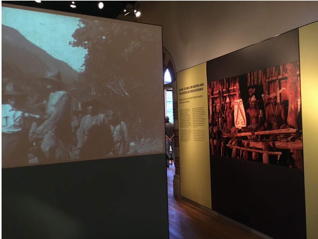
Figure 3. Display of West Papuan men holding a shield adorned with the text, Papua Merdeka /"Freedom for West Papua." Tropenmuseum, Haarlem, the Netherlands.

Another important image in this gallery shows five West Papuan activists holding an Asmat wooden shield with the phrase Papua Merdeka , which translates to "Freedom for West Papua." This photograph offers a visual representation of West Papuan activism and importantly takes into account the contemporary geopolitics of New Guinea. The western half of the island of New Guinea, West Papua, was annexed by Indonesia and integrated as a province after a contested referendum of self-determination in 1969. 7 While the Indonesian military has complete control of land resources in the present day, conflict, violence, and exploitation continue to threaten the survival of West Papuan people. 8 The photo plays a crucial role in the gallery, giving museum visitors an example of how photography is used as a potent tool to assert resistance to colonial powers. Visually, it holds a recuperative purpose and inserts stories of resistance that are often dislocated in ethnographic spaces.