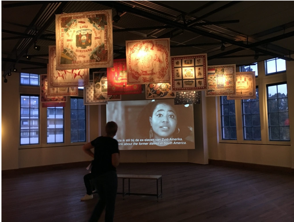
Figure 7. Afterlives of Slavery , installation view at the Tropenmuseum, Haarlem, the Netherlands.

Decolonization in a museum such as the Tropenmuseum would offer something different— a much more unsettling narrative for institutional spaces and perhaps more closely related to ideas presented by West Papuan activist Benny Wenda: