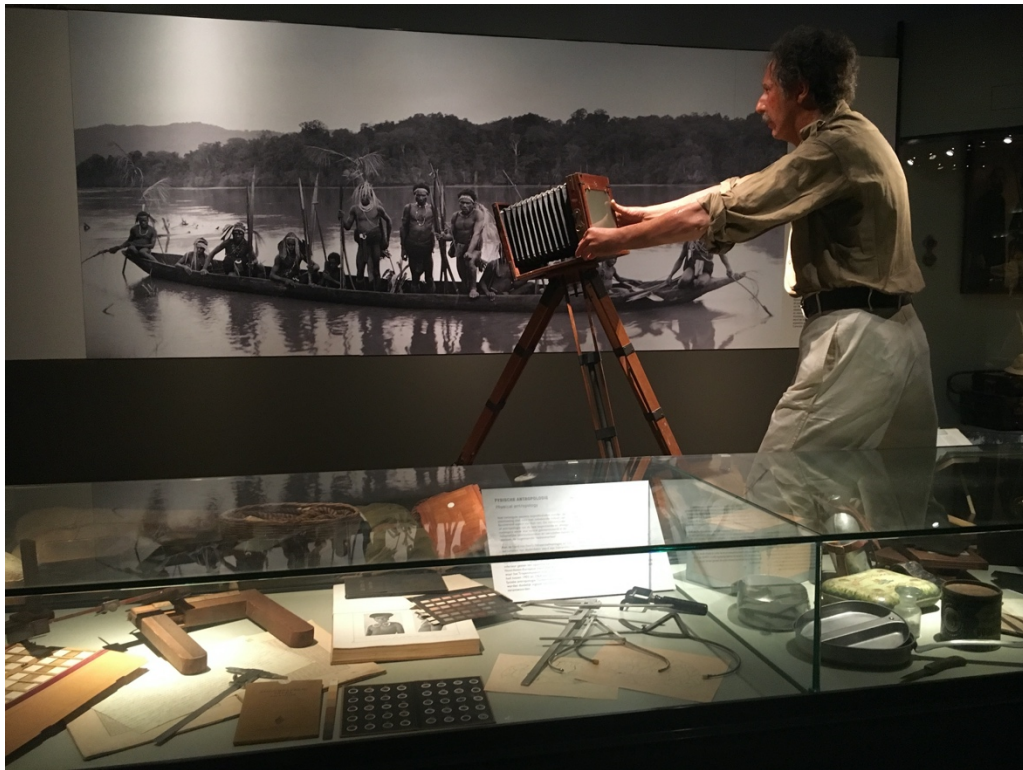
Figure 2. Ethnographic diorama of photographer and Asmat men at the Tropenmuseum, Haarlem, the Netherlands.

matting towards a display that reenacts the moment of photographic capture. The display reveals how the camera has historically been used as a “seeing machine” that disciplines bodies in colonial sites and as an “empire’s technology” that produces indexical evidence for the state. 6 The materiality of the display recodes the meaning of the photograph, inviting viewers into the arbitrary nature of representation by showing what exists outside of the photo’s frame.