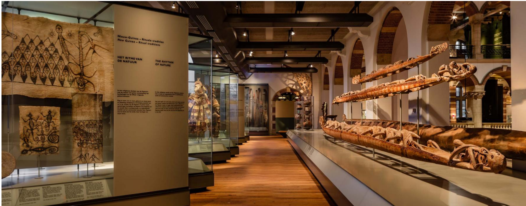
Figure 4. Gallery view at the Tropenmuseum, Haarlem, the Netherlands.