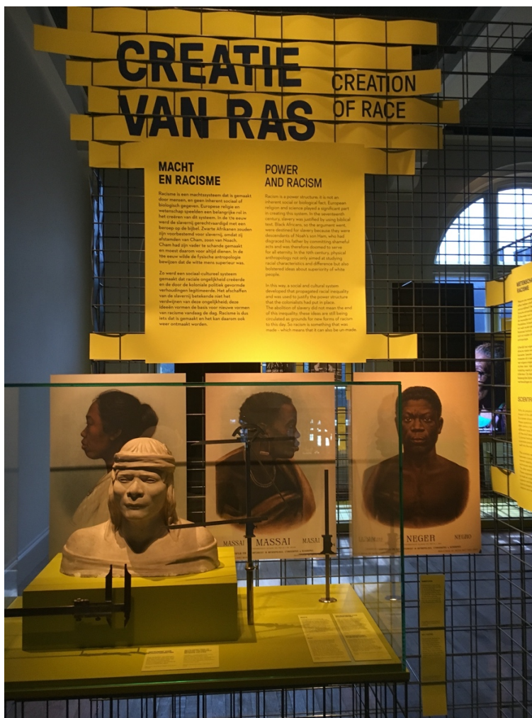
Figure 6. Afterlives of Slavery , installation view at the Tropenmuseum, Haarlem, the Netherlands.

which enslaved people resisted the system, not only by mounting rebellions but also through forms of creative and cultural expression. These latter practices are addressed through contemporary art installations and videos of Dutch poets and spoken word artists. The exhibit ends with a prompt that asks the following question: “What is the price of freedom?” One visitor responded with the following words: “The life you lived before. You must analyze the present, past, and yourself.” This comment shows how Tropenmuseum display creates a space for Dutch viewers to contemplate their own complicity and positionality in ongoing forms of racism and colonialism.