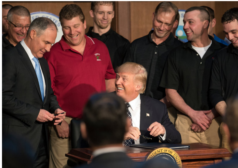
Figure 4. Trump, with EPA Director Scott Pruitt and a group of coal industry workers, signing executive order, March 2017.

couldn't drink or bathe in their tap water for months. Ten thousand gallons of "crude-MCHM," a chemical with effects largely unknown, spilled into the water supply from a crumbling storage tank. 9 The chemical is used to wash coal. In March 2017, the Trump administration announced a sweeping executive order that effectively demolished Obama-era policies on climate change. By repealing climate regulations such as emissions restrictions for coal-fired power plants, Trump has supposedly unshackled fossil fuels industries. Coal industry jobs can return to the country. Rural America, we are told, is ecstatic. Surrounded by coal industry workers, Mr. Trump signed the executive order he promised his rural voters during his campaign. The smiling men appear ready to get back to work, to "make America great again." My mother, a factory laborer in West Virginia, recounts a coworker's excitement the day after this deregulation was announced. With those long, nasal vowels that connect the accents of hillbillies from West Virginia to Alabama, her coworker exclaimed, "They're bringin' back the coal jobs, man! I'm gettin' out of this plant." Another shit town in a shit world. It's almost a blessing that John B. McLemore didn't live to see this.